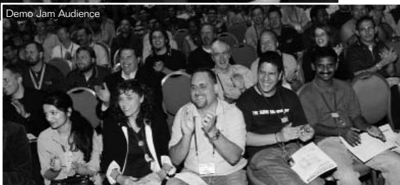
Demo Jam Audience